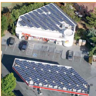
Sharp multi-purpose modules offer industry-leading performance for a variety of applications.