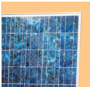
Solder-coated grid results in high fill factor performance under low light conditions.